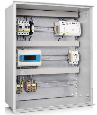
Actual product may vary

Item no. 592.724, 592.724 001, 592.724 002, 592.724 003