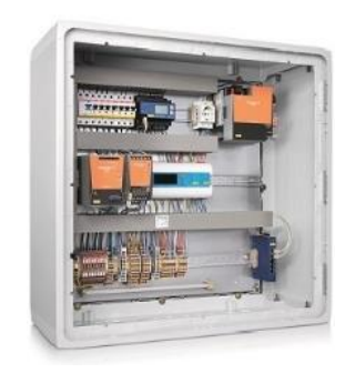
Actual product may yary