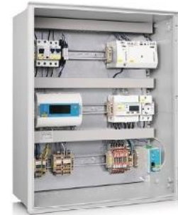
Actual product may vary