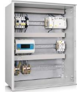
Actual product may vary

Item No.: 592.724, 592.724 001, 592.724 002, 592.724 003