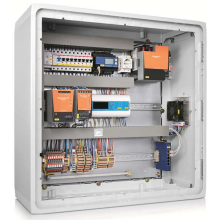
Actual product may vary