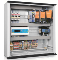
Actual product may vary