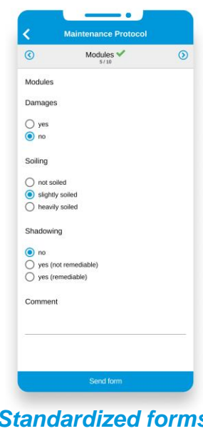
Standardized forms for efficient asset management