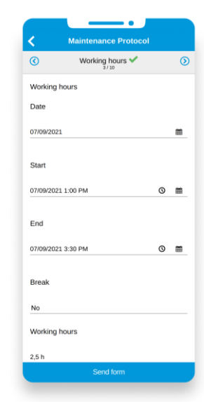
Seamless documentation thanks to digital processing – online and offline