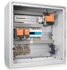
Actual product may vary